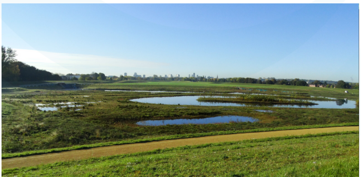
Image: Castle Irwell Flood Plain & Salford Wetlands

For more information, please visit here and here.