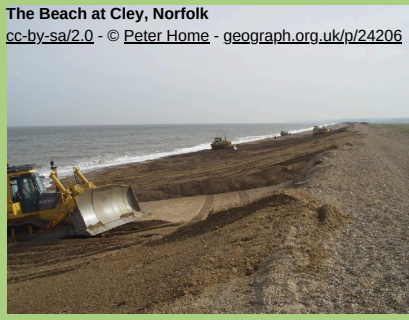
The Beach at Cley, Norfolk

This involves the reshaping of the beach by moving material by machine from areas of accretion to areas where erosion has taken place.