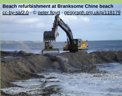
Beach refurbishment at Branksome Chine beach

Material is dredged from the sea bed and pumped to shore along with large amounts of water. As the dredged material is pumped onto the beach the water drains away leaving the sand behind.