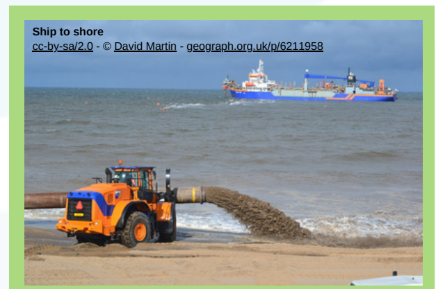
Ship to shore

Each year approximately 400,000m 3 of material is replenished along the coast using GPS to achieve the required design level. The replacement material also provides a buffer to the hard engineered coastal defences reducing the possibility of them becoming undermined by the effects of scour.