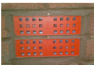
Image: Stormguard flood plan