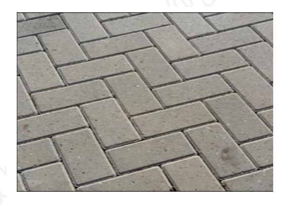
Author's photo of so-called 'permeable paving' which isn't permeable at all; there are no notches in the pavers or gaps between them