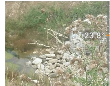
A collapsed structure creates a blockage that prevents water from leaving the feature