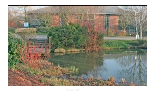
Wetland feature <u>https://www.susdrain.org/case-</u> <u>studies/pdfs/aztec_west_business_park_south_gl</u> oucestershire_final_v2.pdf