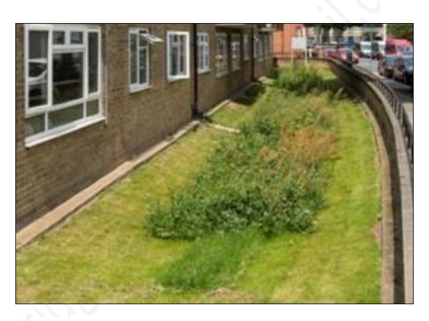
Swale: <u>https://www.susdrain.org/case-</u> studies/pdfs/queen_caroline_estate_london_ final_v2.pdf