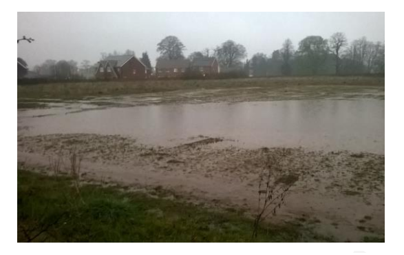
Half built swale but left as if complete

A blockage has resulted in standing water which has developed an algal bloom. The sides of the swales are not correctly planted