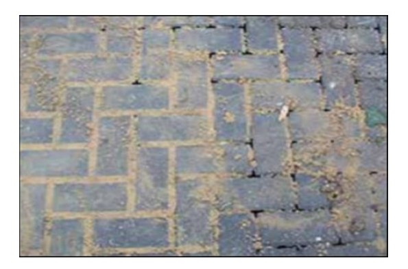
Blocked permeable paving