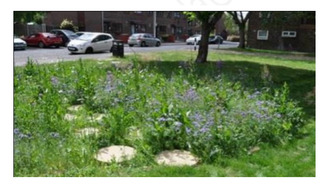
Rain garden :<u>https://www.susdrain.org/case-</u> studies/pdfs/renfrew close london final v2.pdf

Bioretention systems (including rain gardens) are shallow landscaped dips in the ground or small gardens sunk in the street that can slow the flow and absorb water. They can even use the soils and plants they contain to treat pollution; this is especially useful by roads. In effect, they intercept rainwater and reduce flood risk whilst creating 'greener' and more attractive places to live and work.