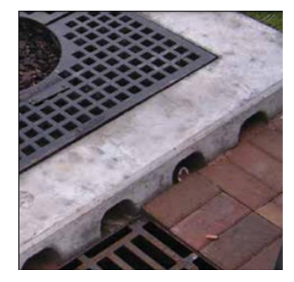
Outlets blocked by other features