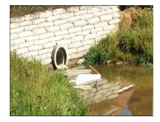
Rubbish could create blockages