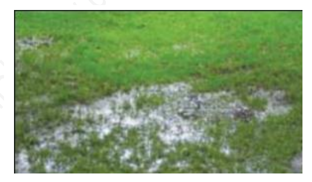
Compacted soil leading to water pooling on the surface

The capacity of soil to absorb water can also be seriously reduced when just a thin layer on the surface becomes compacted, forming a hard crust. This can be dealt with relatively easily, but can have significant consequences for drainage, flooding and the health of anything planted in it.