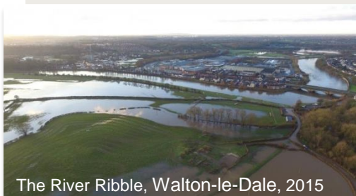
The River Ribble, Walton-le-Dale, 2015