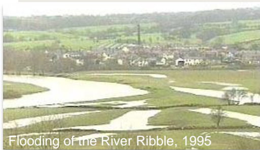
Flooding of the River Ribble, 1995