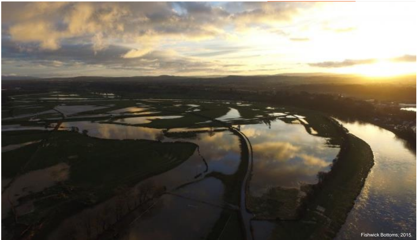
Fishwick Bottoms, 2015.