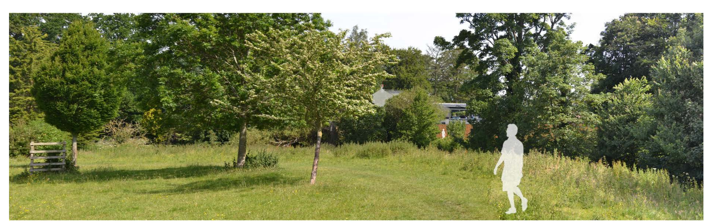
View 1 - After (Visualisation indicates Year 15 mitigation) View east from Rickerby Park toward Rickerby Retreat and Spa