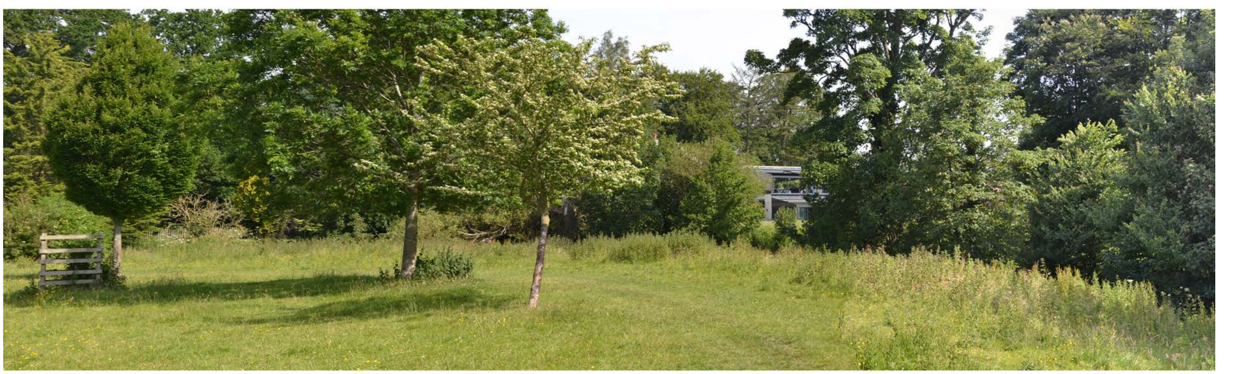
View 1 - Before View east from Rickerby Park toward Rickerby Retreat and Spa