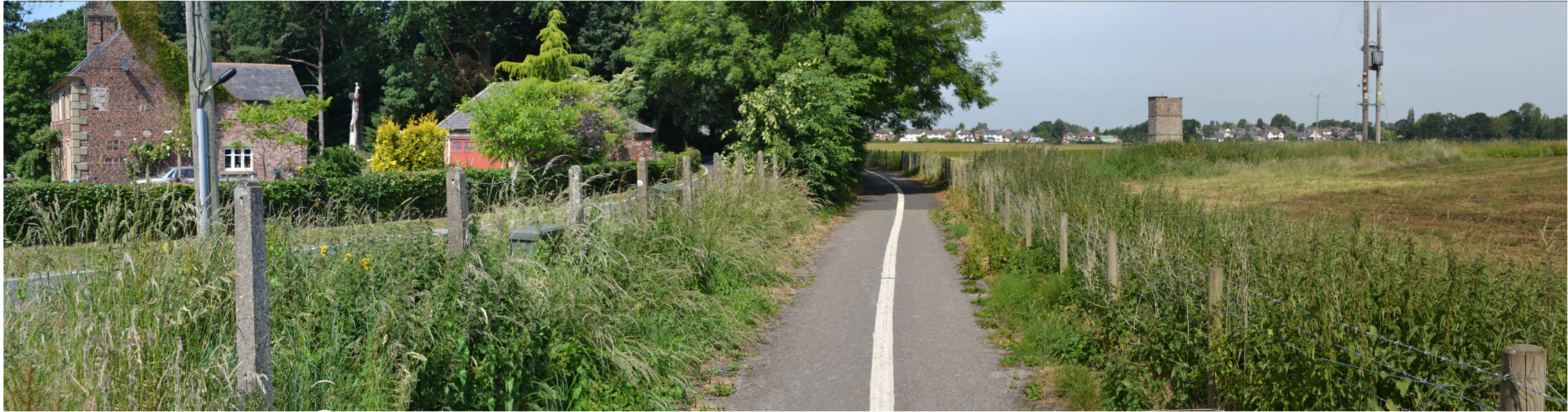
View along the existing Rickerby Park Road and footpath/ cycleway