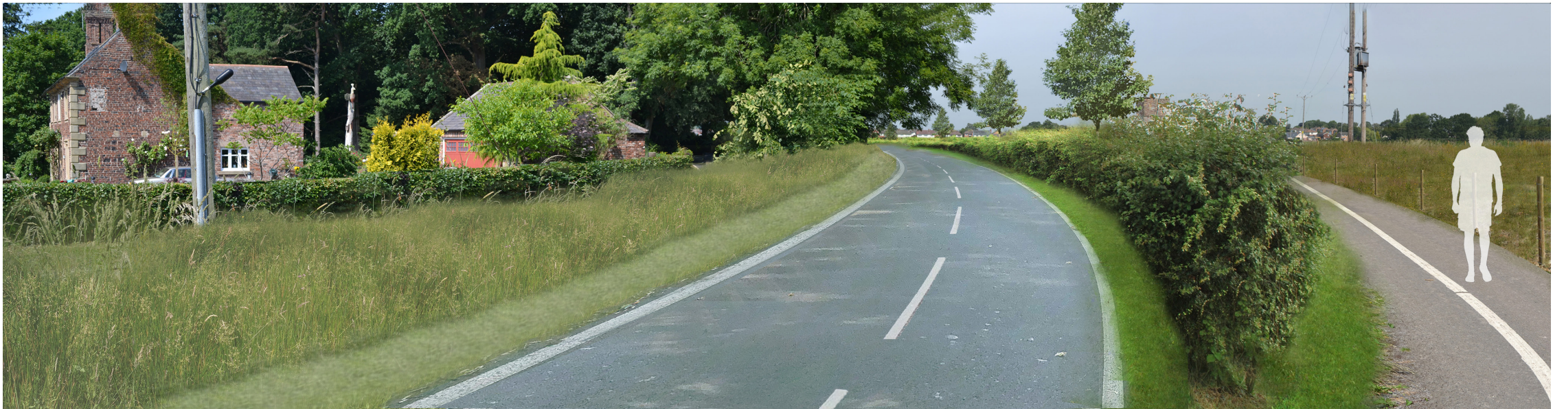
View along the realigned Rickerby Park Road and footpath/ cycleway

SAFETY, HEALTH AND ENVIRONMENTAL INFORMATION