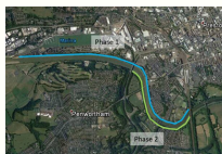
PRESTON AND SOUTH RIBBLE