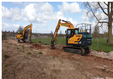
Essential works are continuing safely