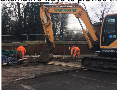
Foundation strengthening at the Sands Centre