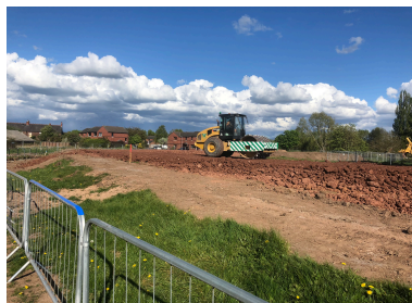
Melbourne Park embankment construction

Construction work started in July 2019 to raise and extend existing flood defences along the River Eden and improve water conveyance through Botcherby Bridge on the River Petteril. Whilst major construction activities were paused throughout the winter months, we focused efforts onto other tasks such as embankment drainage to accelerate our return in Spring 2020. Essential construction works in Melbourne Park recommenced in April and are being carried out in line with the Government's most up to date advice and social distancing measures during the COVID-19 pandemic. We are working hard to complete Phase One works by Autumn 2020. Our landscape design plans to enhance Melbourne Park are being finalised and we will share more on this in the future.