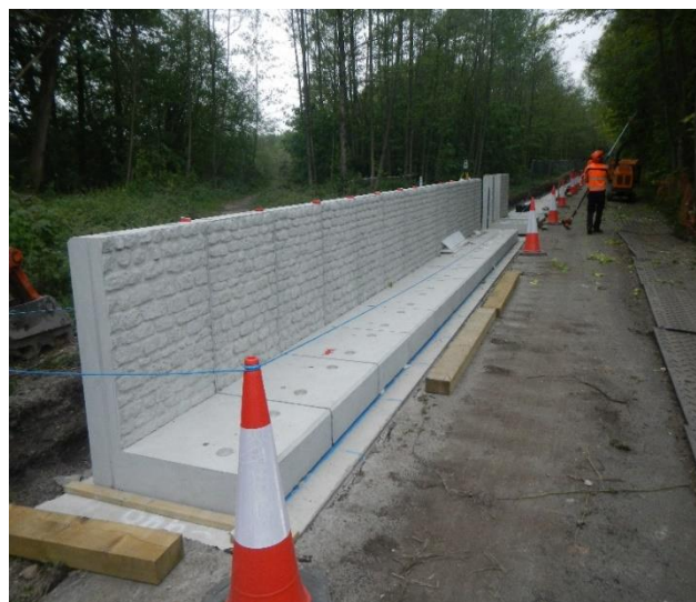
Flood wall units starting to be put into place along the Millennium cycle path.