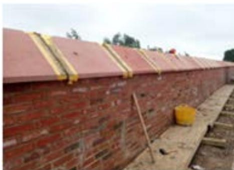
Petteril wall raising and replaced copings