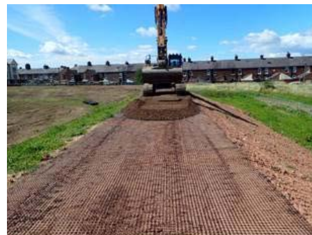
Melbourne Park embankment raising