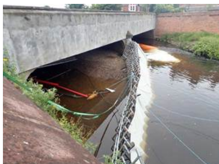
Works recommenced at Botcherby Bridge

Our consultation with residents at Riverside Way and Falcon Mews has helped shape our landscape design plans to enhance Melbourne Park. The plans will become available to view on the Flood Hub. This autumn, we are intending to raise the Eden embankments and install a new flood gate at the Tesco entrance off Warwick Road. We will share further details in due course.