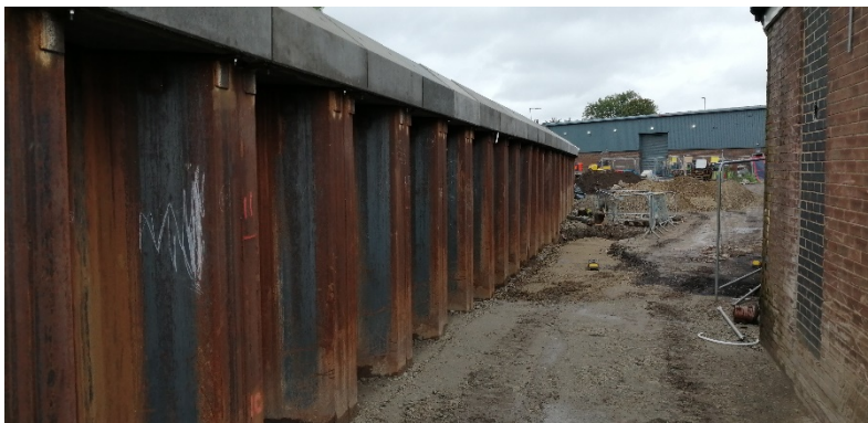
Flood defences at the rear of businesses on Dumers Lane

The project team are pleased to announce that Phase 1 flood defences are now watertight and reduce the risk of flooding to properties in and around Parkside Close. Construction completion of Phase 1 will be in mid-October 2020, with additional landscaping activities in the autumn.