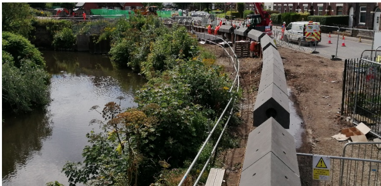
Flood defences along Dumers Lane