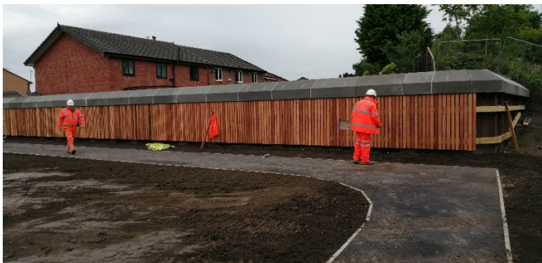
Flood defences in Close Park