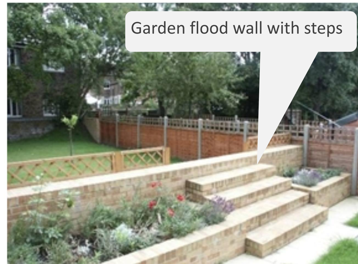
EA Fluvial Design Guide (Garden walls)