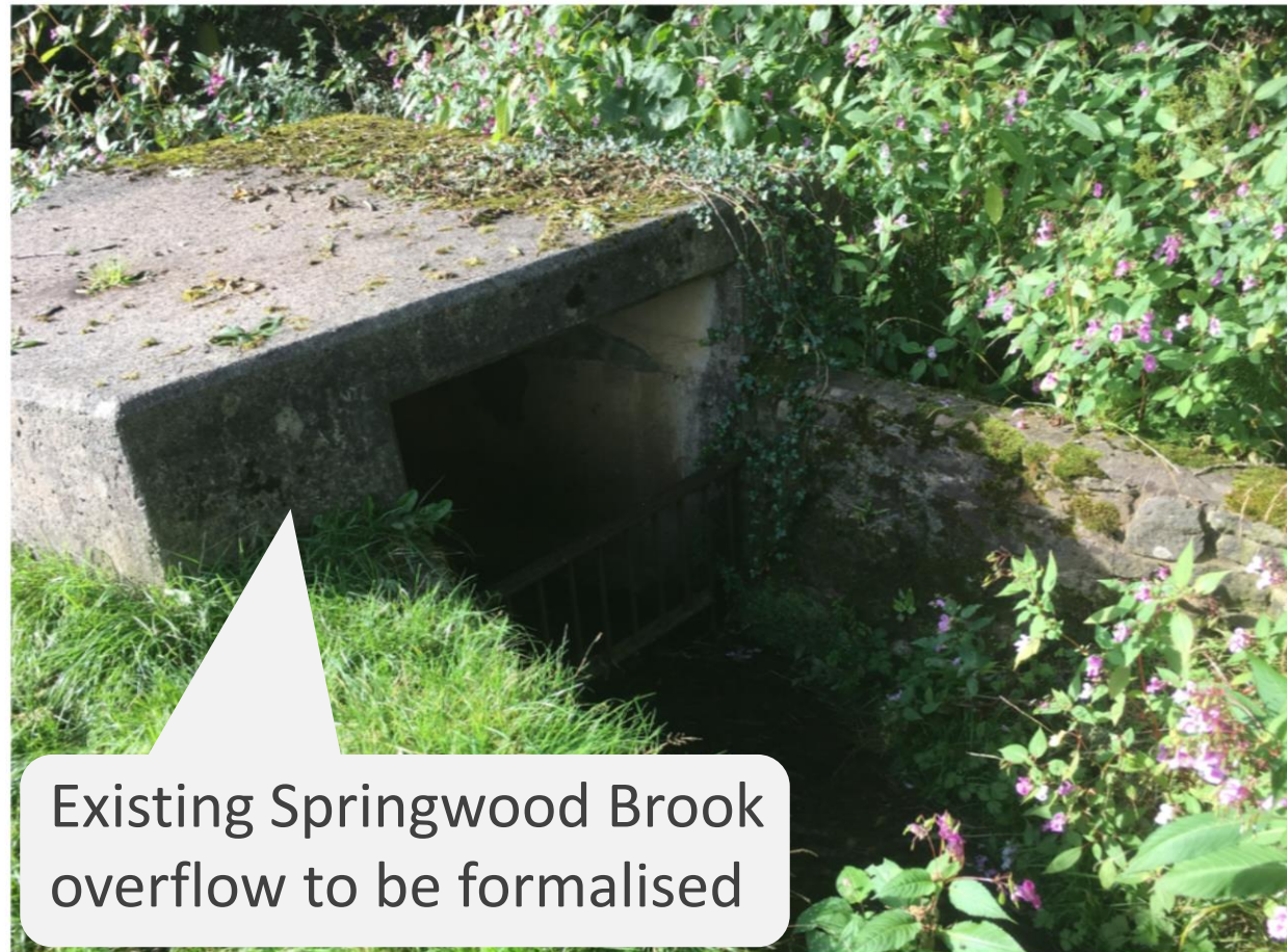
Existing Springwood Brook overflow to be formalised