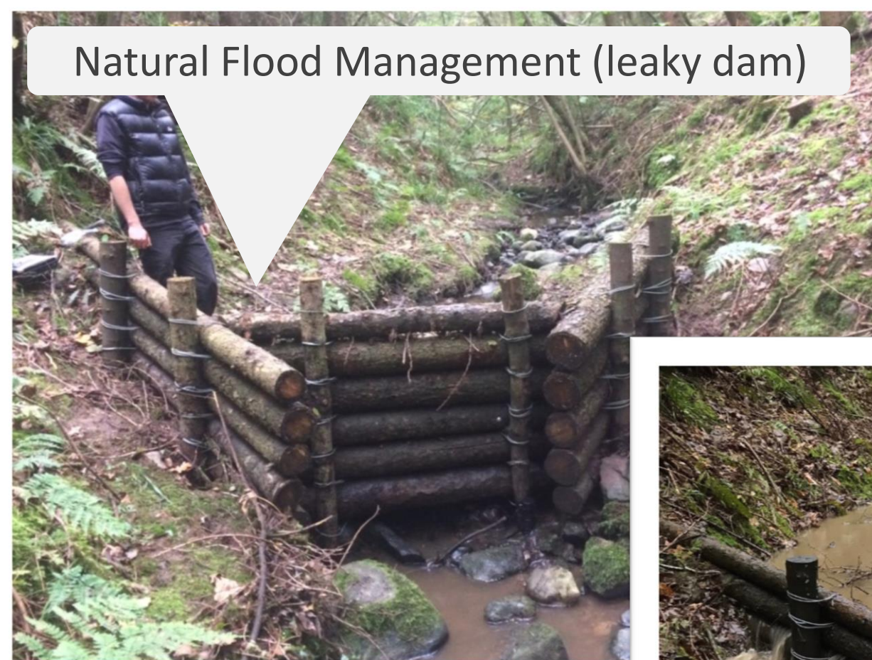
Natural Flood Management (leaky dam)