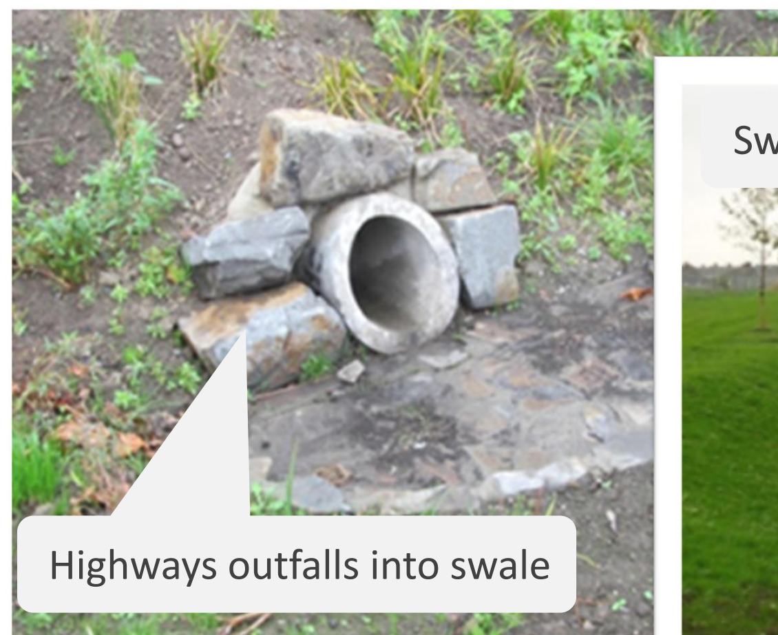
Highways outfalls into swale