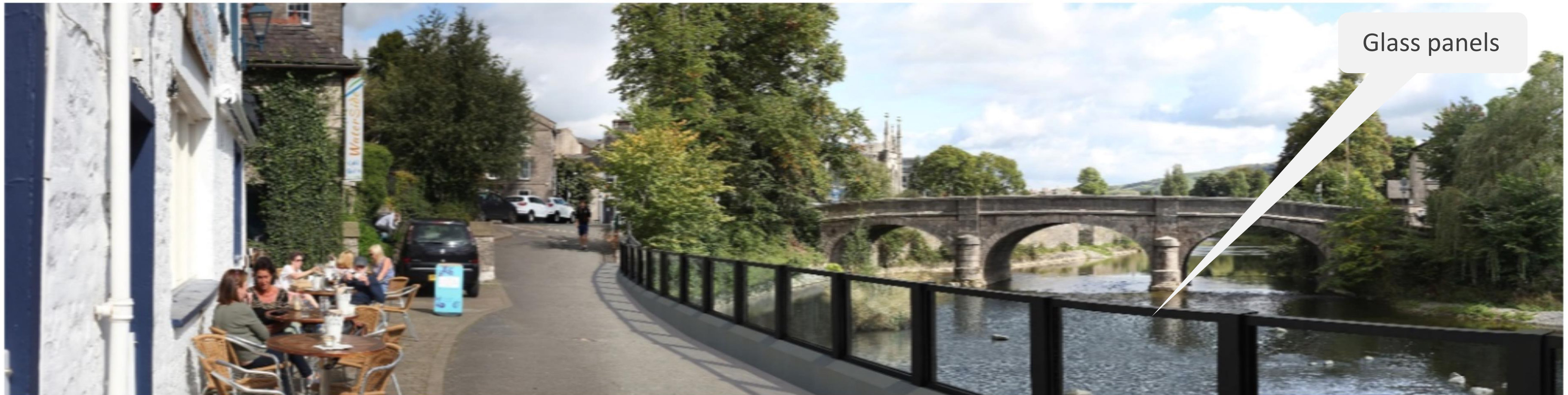
Kendal (Design Concept Image)