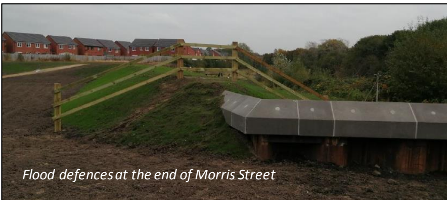
Flood defences at the end of Morris Street