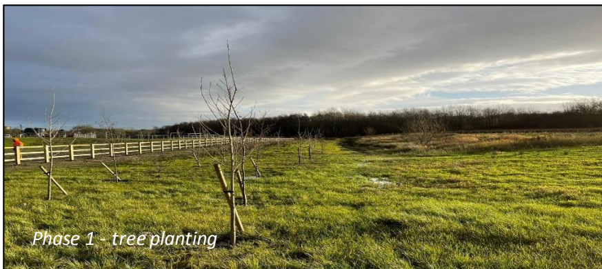
Phase 1 - tree planting

Close Park is now open to the public, with only localised areas closed off to be grass seeded in the spring.