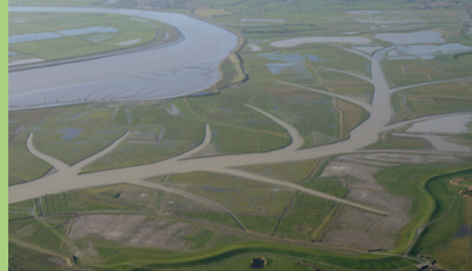
Hesketh Out Marsh West in the Ribble Estuary during the construction phase