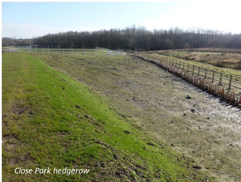
Close Park hedgerow

Although construction of the flood defence is complete in Close Park and Dumers Lane, landscaping works and final touches are planned for the spring.