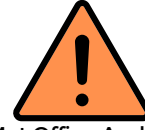
Met Office Amber Weather Warning