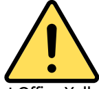
Met Office Yellow Weather Warning