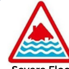
Severe Flood Warning