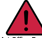
Met Office Red Weather Warning