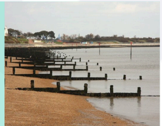
Dovercourt groynes

Groynes are low lying wood or concrete structures which are situated out to sea from the shore. They are designed to trap sediment, dissipate wave energy and restrict the transfer of sediment away from the beach through long shore drift. Longshore drift is caused when prevailing winds blow waves across the shore at an angle which carries sediment along the beach. Groynes prevent this process and therefore, slow the process of erosion at the shore. They can also be permeable or impermeable, permeable groynes allow some sediment to pass through and some longshore drift to take place. However, impermeable groynes are solid and prevent the transfer of any sediment.