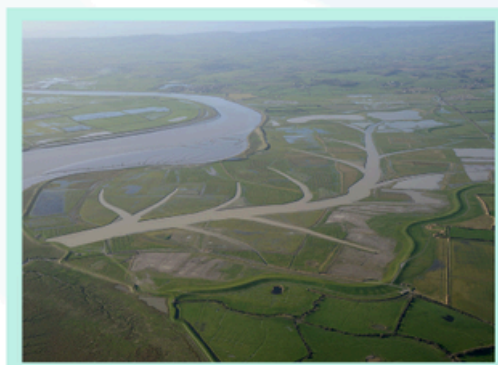
Image: Hesketh Out Marsh West in the Ribble Estuary during the construction phase

In August 2017 the Environment Agency and the RSPB saw the completion of the Hesketh Out Marsh East Managed Realignment Scheme become the largest scheme of its kind in the UK.