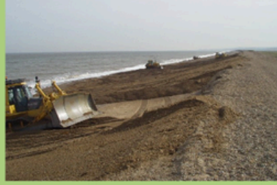
The Beach at Cley, Norfolk