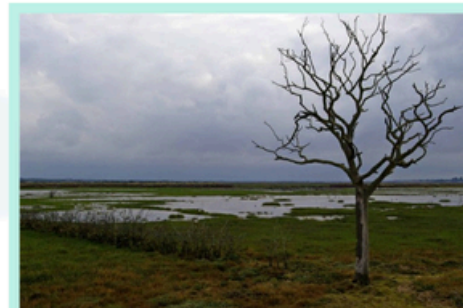
Managed Retreat near Tollesbury

An embankment was constructed inland of the existing defences and in 1995, the earth bank which held back the sea was deliberately breached to allow approximately 21 hectares of land to flood once again, allowing mud flats and salt marsh to form naturally.