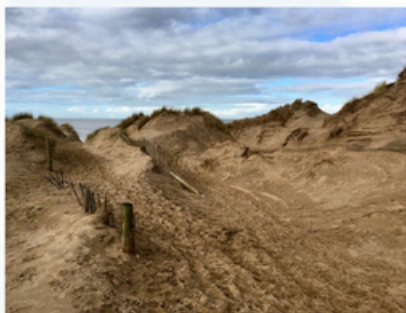
Sand dunes at Formby Point

This can be used in combination with dune planting to encourage seaward dune growth.