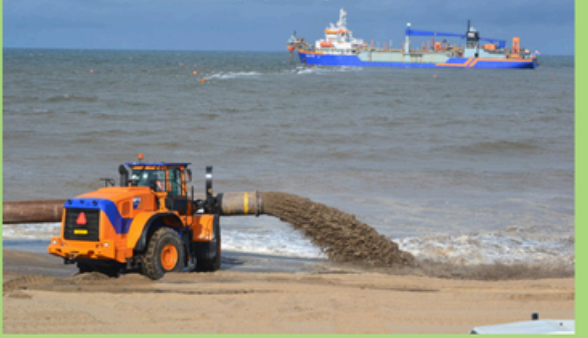
Ship to shore

Each year approximately 400,000m 3 of material is replenished along the coast using GPS to achieve the required design level. The replacement material also provides a buffer to the hard engineered coastal defences reducing the possibility of them becoming undermined by the effects of scour.