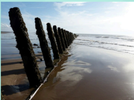
Walney Island Groynes (5) - Northern row in wet sand

Walney Island is a narrow island off the west coast of England, which forms a part of Barrow-in-Furness. The island is home to 13,000 residents and is approximately 11 miles in length and covers 5 square miles. The island is relatively narrow at points, with the narrowest section being 250 metres wide. The west coast of the island is exposed to the Irish Sea and the east coast has many low lying wet marshlands. Exposure to high tides and storm surges has caused progressive coastal erosion over time as well as extreme flood events. Often, these flood events have been capable of breaching the narrowest parts of the island, separating the south of the island from the north and at times, this has cut off access to more rural communities and businesses. In order to reduce the flood risk and limit the amount of coastal erosion, wooden groynes have been built along the coastline. It is hoped that these defences will also prevent the island being divided during high tides.