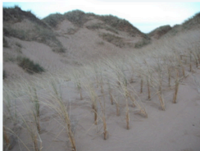
NJ9921 Dune stabilisation at Menie May 2010

Established plants also reduce wind speed over the dunes, slowing erosion. Plants may be self sustaining after initial period of establishment.