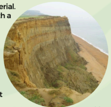
Image: South Coast Cliffs by Nigel Freeman - geograph.org.uk/p/581176