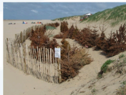
KA / Sand Dune Restoration / CC BY-SA 2.0

A benefit of this technique is that there is no establishment time required.