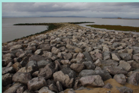
Fish-tail groyne, Morecambe