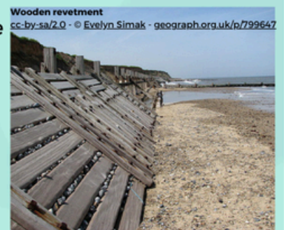
Wooden revetment

Revetments are sloping structures built on embankments or shorelines, along the base of cliffs, or in front of sea walls to absorb and dissipate the energy of waves in order to reduce coastal erosion. They can be made of concrete, stone, asphalt or wood, and the height of the revetments is designed to stop waves overtopping the defence. Revetments can be both permeable and impermeable; the permeable revetments are generally built from rock or concrete armour, gabions, and timber. They reduce the erosive power of waves by dissipating their energy as they reach the shore. Impermeable revetments are continuous sloping defences made of stone or concrete which act as a fixed line of defence and are designed to act as a barrier against high tides and storm surges.