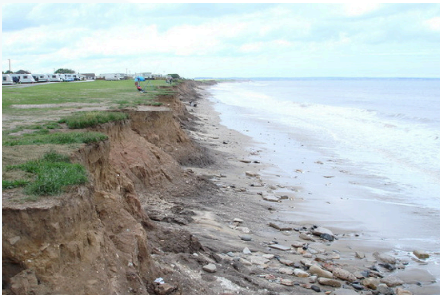
Image: Coastal erosion at Ulrome, East Yorks