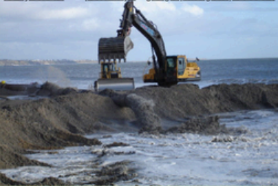
Beach refurbishment at Branksome Chine beach