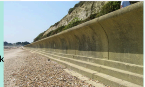
Sea wall - below Highcliffe Castle Golf Club

Sea walls are a solid barrier made from concrete, masonry, or gabions and are designed to prevent high tides and storm surges reaching inland and causing flooding. They can have a variety of profiles such as sloped, stepped or vertical, and are designed to withstand the force of waves for around 30 to 50 years. A number of sea walls have been constructed across the UK to reduce the risk of flooding however they require frequent maintenance so that they don't fail.