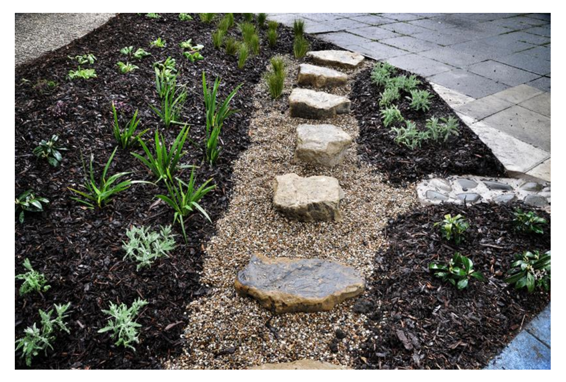
Fig 2: Stepping stones provide the opportunity for school children to interact with the raingardens