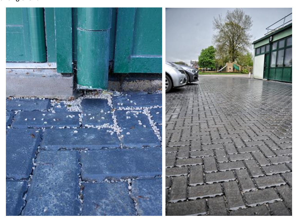
Fig 5: Permeable paving replaces an existing tarmac car park and offers a SuDS solution where space is at a premium