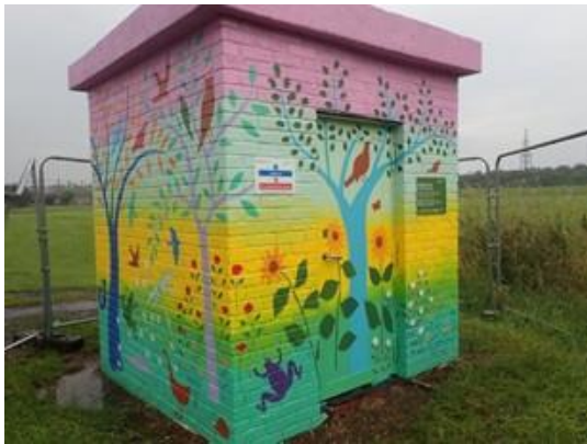
Mural on Melbourne Park gauging station

A mural has been painted on the Melbourne Park gauging station by local artist Lydia Leith and volunteers. The mural aims to develop the aesthetics of the park, by improving the appearance of a building that was previously graffitied.