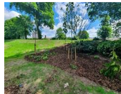
Landscaping works complete as part of Phase 2.

With phase 3 we are currently looking at long-term interventions to ensure that the end result takes into consideration climate change and relevant new guidance. This is to ensure that the solution implemented offers a long term benefit to the local community and partners. The previous proposal to raise existing defences along the River Caldew along with enhanced maintenance of the river corridor did not offer the long term benefits and as such the Phase 3 project will now embark on looking at other potential proposals that provide the long term benefits to Carlisle.