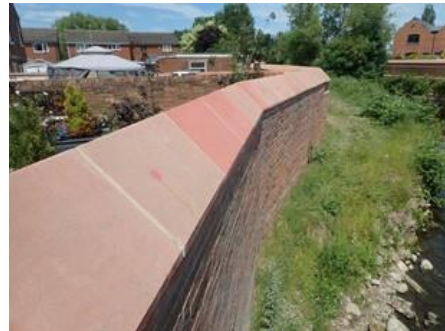
Coping stones now installed at Botcherby Bridge

The landscaping comprises some areas of wildflower planting on the eastern side of Melbourne Park and some new trees and hedges. The flood banks have a species rich grass on the dry side and an amenity grass on the wet side. The wildflower meadows do take some time to become established and a cutting regime has been implemented to encourage growth, with weed control being undertaken as required. Bulb planting will take place in specific areas of the park in autumn, to further brighten the park and improve biodiversity. Field gates are to be installed as planned local to Riverside Way, in the coming weeks.