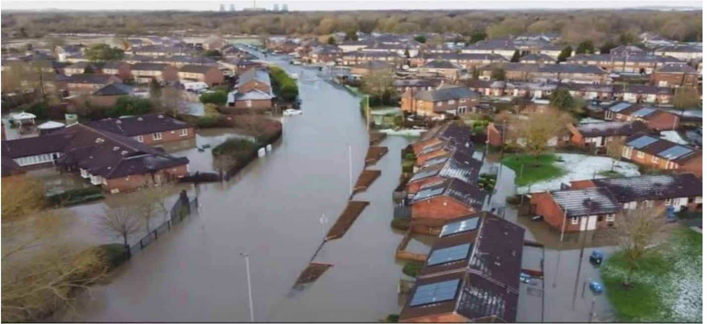
Dallam Brook