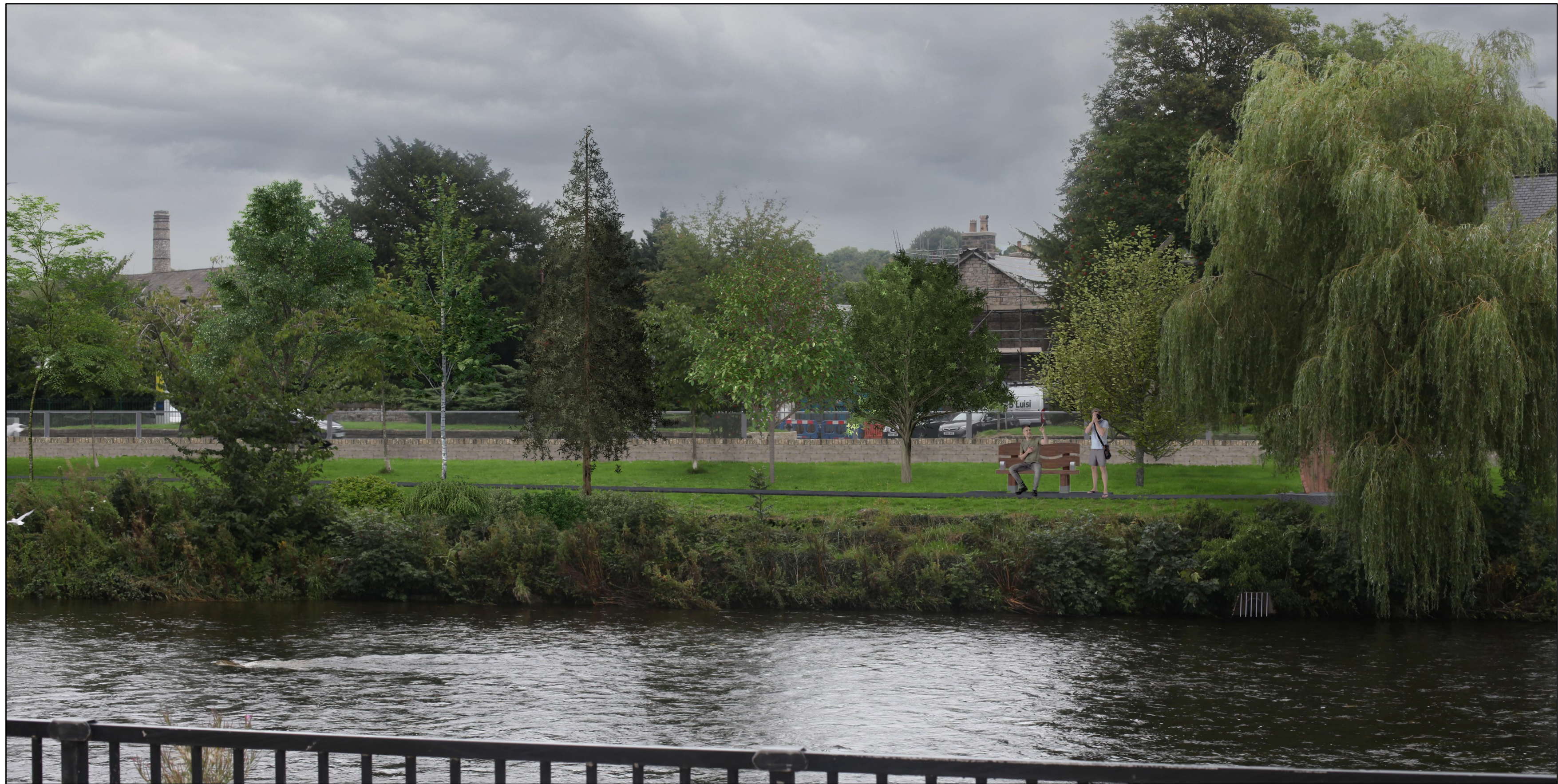
Proposed view illustrating wall mounted glass panels to rear of Miller Field, footpath, seating sculpture and Castle Mills outfall visible within view(TBC). Decorative tree planting across view (5years growth) . Existing riverside vegetation on and below lower riverbank to be retained.