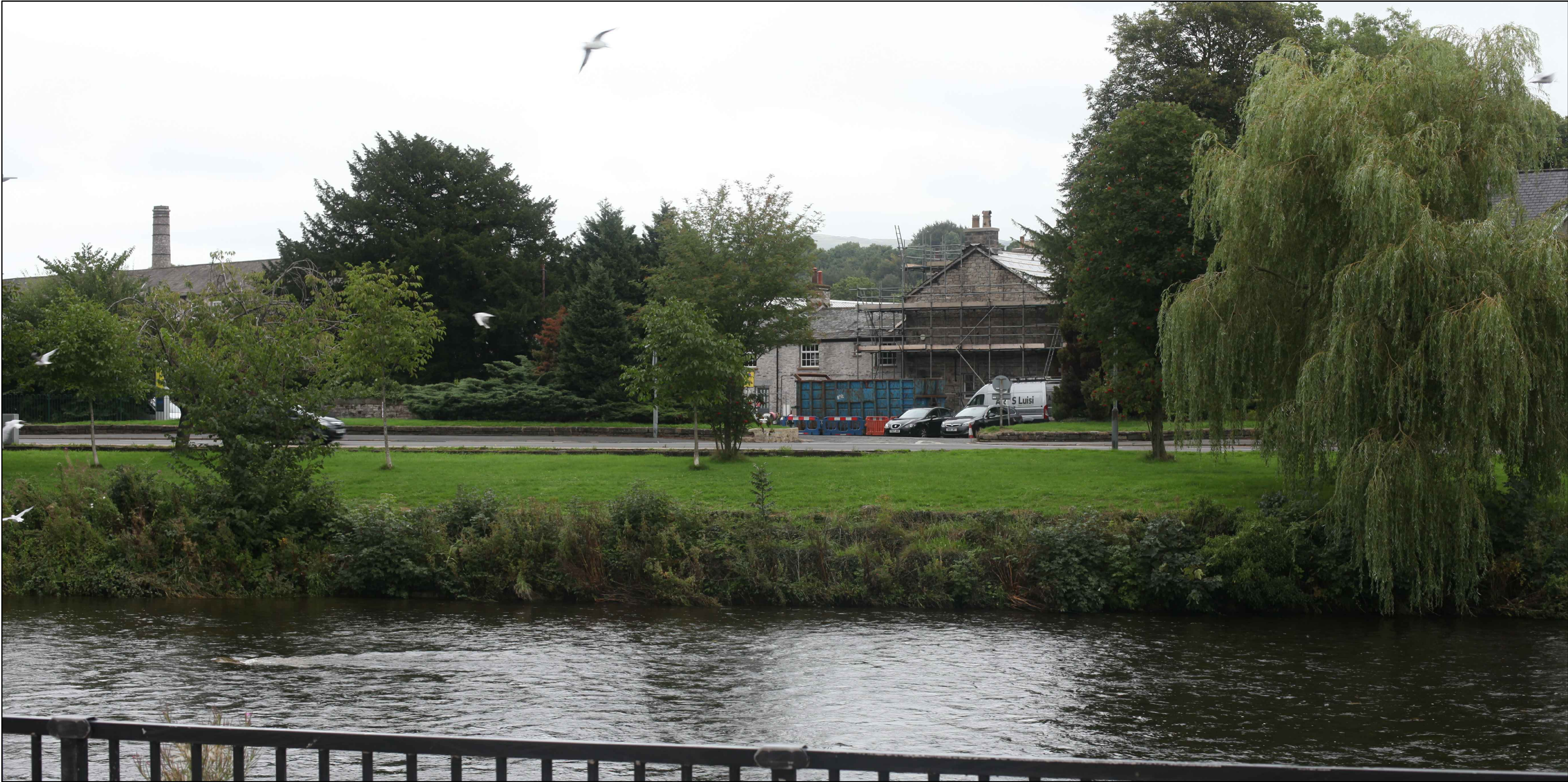
Existing view from Waterside looking east across River Kent towards Millers Field with Castle Mills to far side of Aynam Road