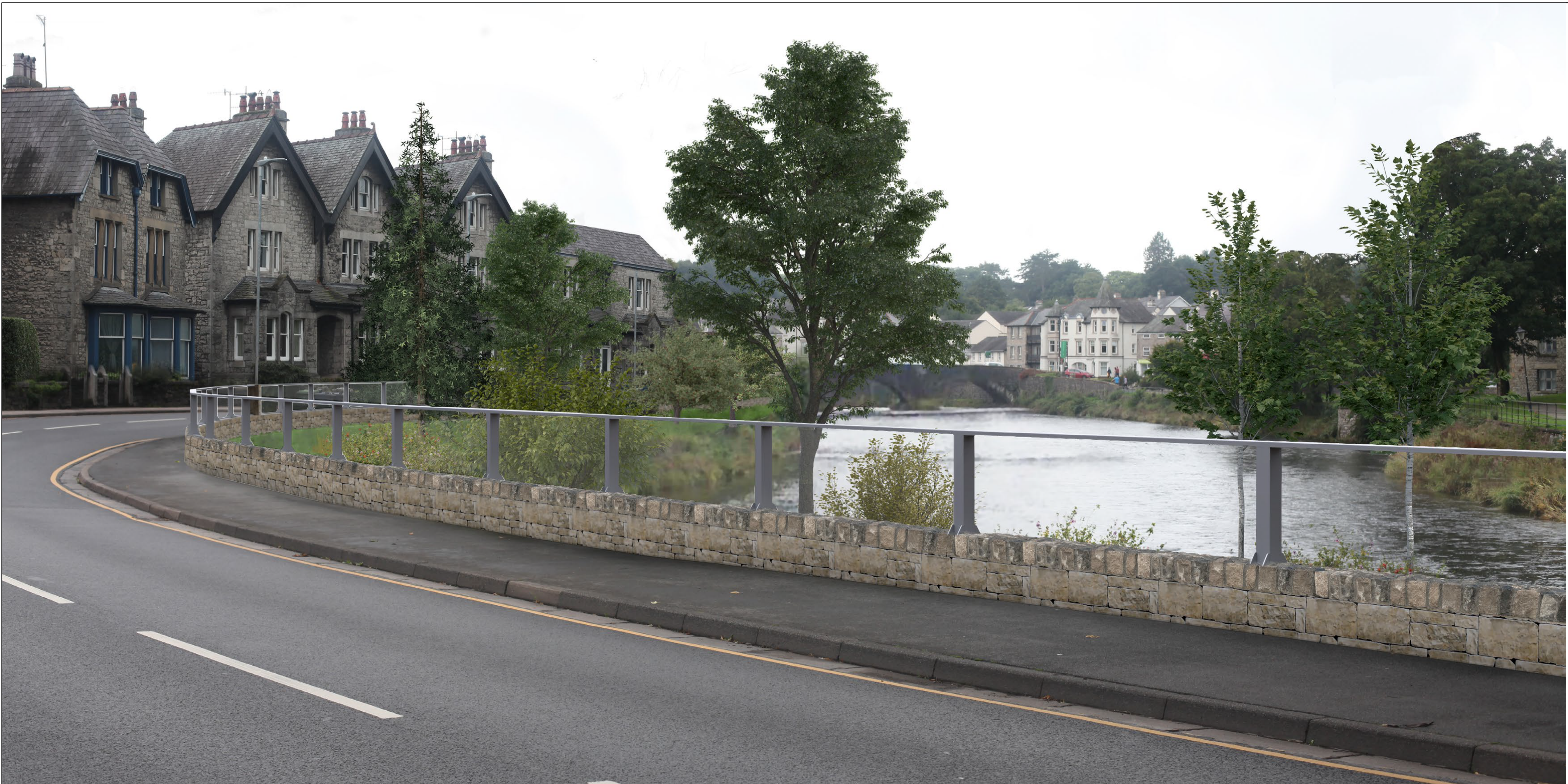
Proposed view illustrating all existing trees cleared to facilitate works with proposed glass panel fixed to low stone clad wall located at rear of the footway. Tree planting proposed where ground conditions allow (after 5year growth).