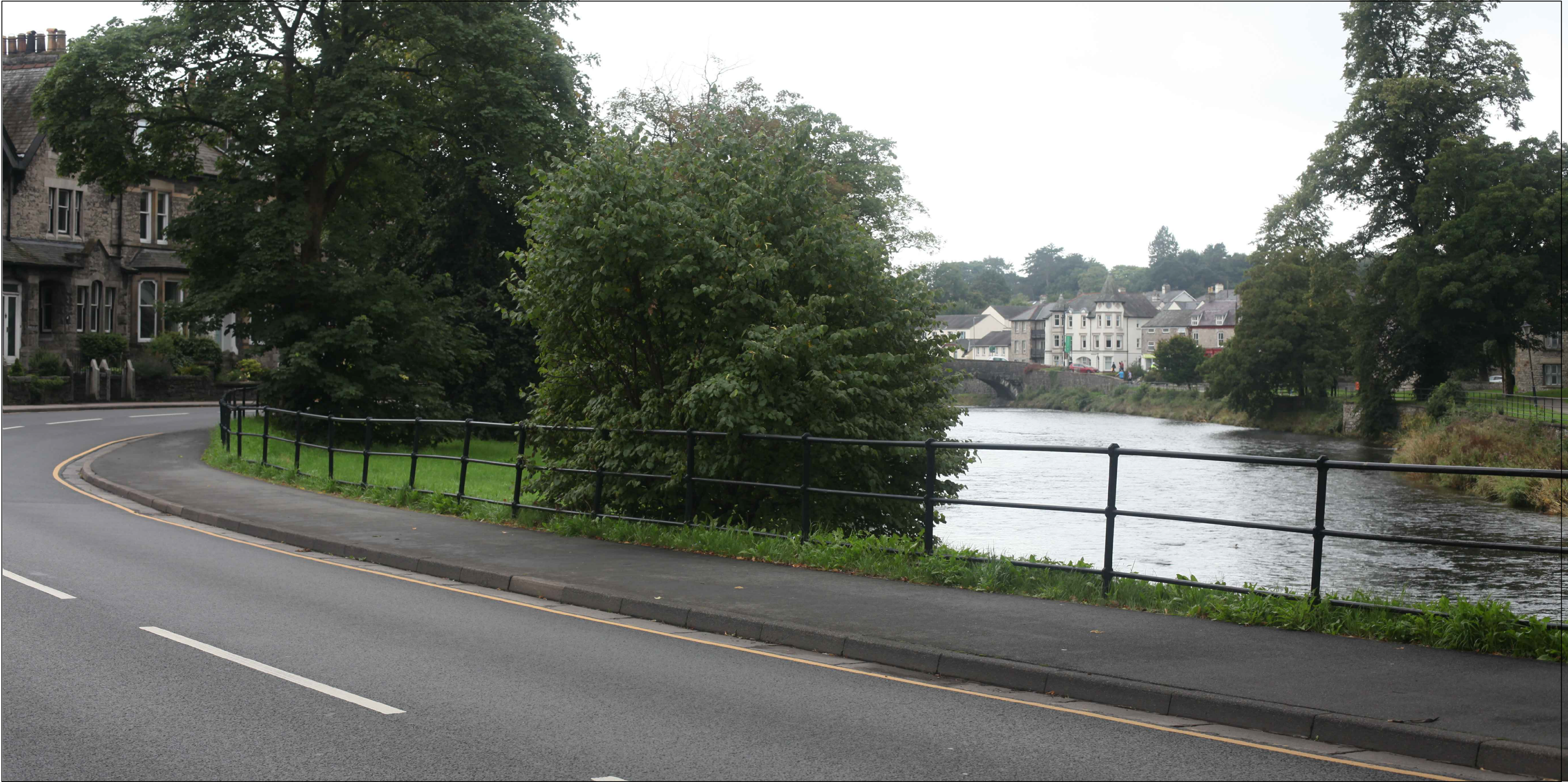
Existing view from Aynam Road looking south with River Kent and the Parish Hall to the right of the view