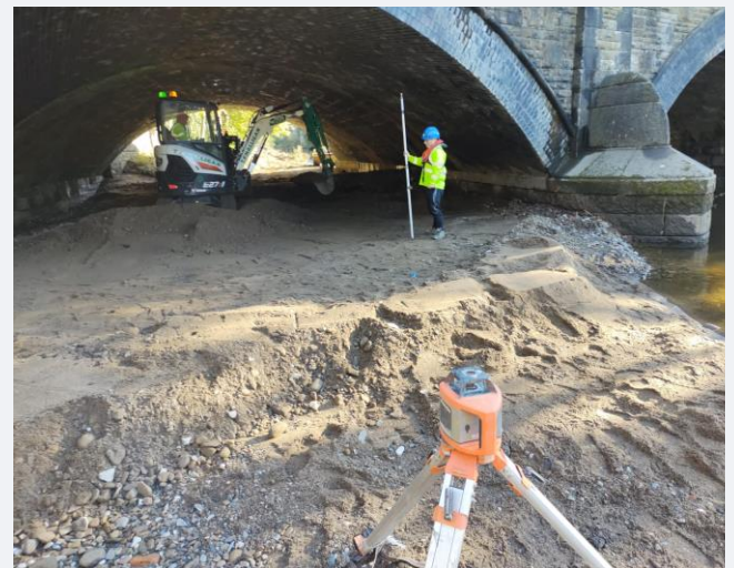
Works at Padiham Bridge