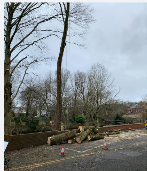
Tree Removal at Town Hall