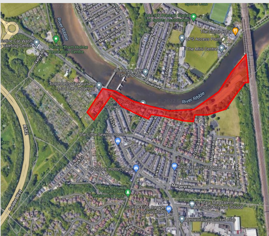
Preston and South Ribble Flood Scheme Area 1

Area 1 has experienced challenges following completion of our ground investigation works. This required a change in foundation and piling design in the Broadgate area. These issues have now been resolved with the detailed design expected to be completed in summer 2022. Surveys of properties within the Broadgate area are continuing and are planned to be completed by summer 2022. Works to divert cables and sewers along the scheme length are planned to start in summer 2022. Once these services have been moved then construction of the new defences can begin in autumn 2022. All dates are subject to change.