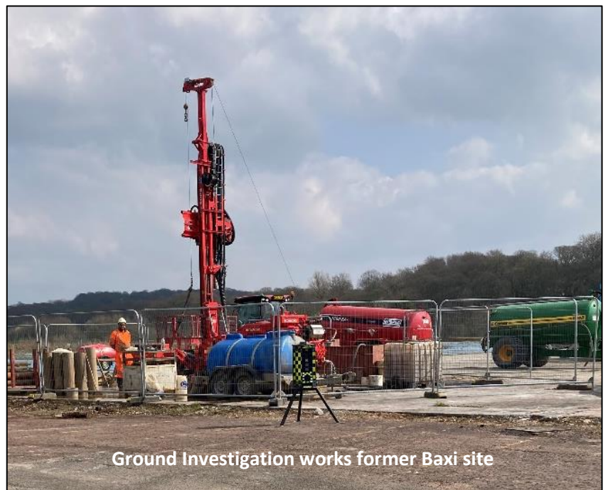
Ground Investigation works former Baxi site