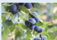
Blackthorn (prunus spinosa)