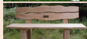
Reclaimed timber seating will feature throughout the scheme.