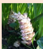
Reintroducing species like the Westmorland Damson Toothwort

Rich, diverse shrub and ground flora planting will provide essential habitat and food for our much loved pollinators. It will provide a mix of natural wildflower areas as well as more formal ornamental planting in more central areas of town. Working in partnership with Kendal in Bloom, you will find this planting in areas such as Miller Fields, along Aynam Road and Ford Park.