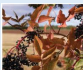
Elder (Sambucus nigra)