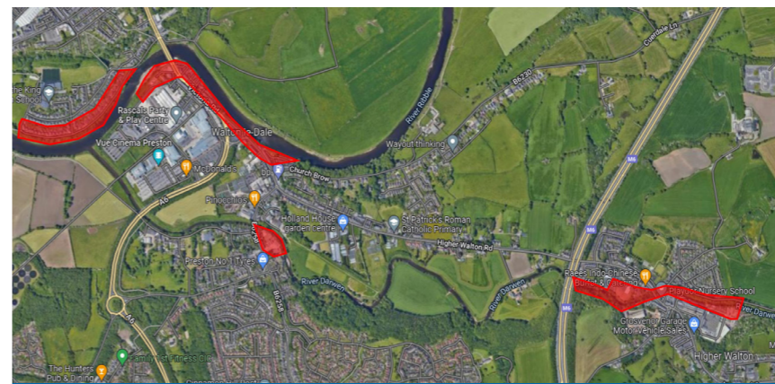
AREA 3, 4 & 5: Fishwick, Walton le Dale & Higher Walton

Area 3, 4 & 5: Site investigations and design work are planned to commence in Winter 2022. We will be excavating trial holes and sinking boreholes to inspect the ground conditions. The information gathered will help finalise the design.