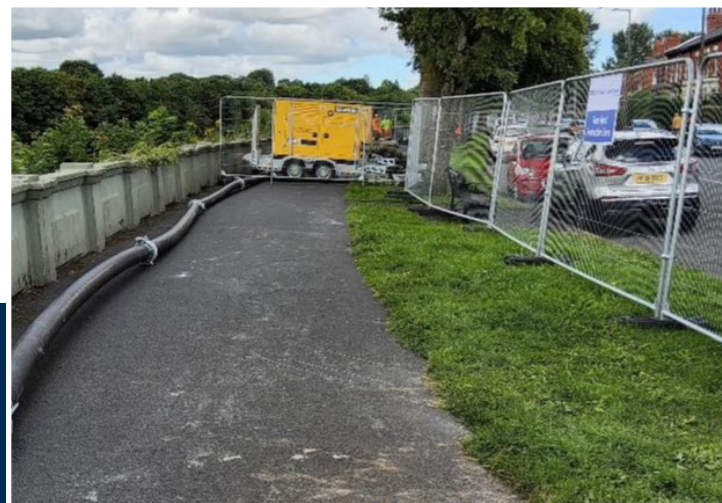
Lining the sewer along Broadgate

Finally, Electricity North West has been diverting a high voltage power cable along Leyland Road, Talbot Road and Margaret Road. It will then be 'tied in' at the West Coast main line railway embankment, over the river from The Continental. The work is scheduled to be completed in October. Following this work, United Utilities will undertake a small sewer diversion, and this will then allow the flood defence construction to progress along Riverside Road.