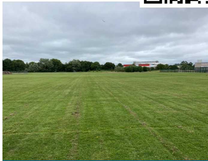
Pitch at Archbishop Temple High School

The pitches will remain in place after the flood