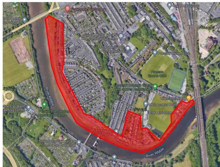
AREA 1: Broadgate & Riverside

Area 1: Work has been completed on the United Utilities' sewer that runs along Broadgate up to Penwortham Old Bridge, close to the existing flood wall. Work was being carried out by our sub-contractor, who are lining and strengthening the existing sewer prior to work starting on the flood defences. This work is scheduled to be completed by mid-September.