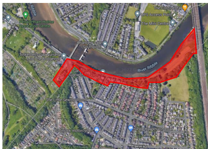
AREA 2: Lower Penwortham

Electricity North West will begin diverting cables once the sewer work is complete. This task should be finished by the end of October, which will then allow the main flood defence construction to begin.