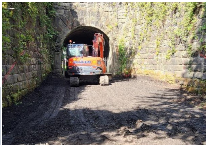
Clay embankment at St Mary Magdalen School