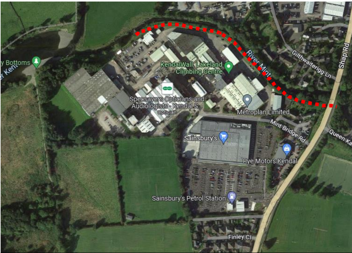
The red dotted line shows footpath closure

We are currently undertaking works in one location in the northern end of Kendal and a number of sites within central Kendal. The following plans provide detail of these works where footpaths or roads are impacted.