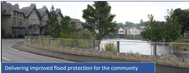
Delivering improved flood protection for the community