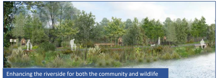
Enhancing the riverside for both the community and wildlife

We are delivering a flood risk management scheme that runs from Helsington Mills in the Southern end of Kendal to Mintsfeet in the Northern end of Kendal. The complex nature of delivering a long linear scheme through a busy town centre has led us to break down the scheme into a number of small sections we term as 'reaches'. The order of work is influenced by minimising disruption within the town and ensuring we manage flood risk. We will be starting work in the Southern reaches and working up towards the Northern reaches, with a number of reaches being delivered at the same time. The ordering of these have been carefully considered so we can ensure we minimise any traffic or pedestrian disruption in and around the town.