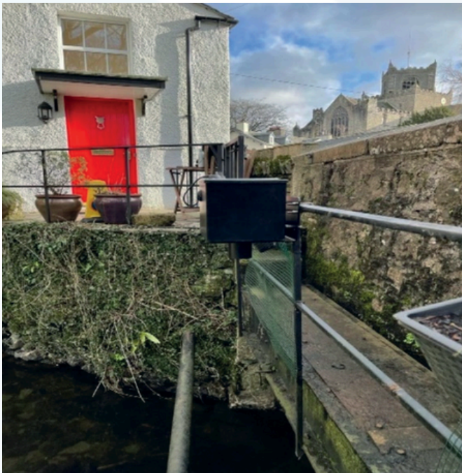
Wheelhouse Bridge monitoring station

The Flood Warning Expansion Project (FWEP) is a Treasury-funded £5.15 million project which is being delivered by the Environment Agency (EA) between 2019 and 2023. The aim of the FWEP is to provide a flood warning service to all 26,000 properties in England at high risk* of flooding, that currently have no flood warning service. The majority of these properties are located within areas which have traditionally been difficult to provide a flood warning service to. For example, rapid response catchments , smaller urbanised watercourses, small collections of rural properties, or dispersed communities. The local EA Flood Resilience team in Cumbria and Lancashire have been delivering FWEP since 2019. Their final new flood warning service was launched on 7th December 2022 for Braithwaite, Cumbria.