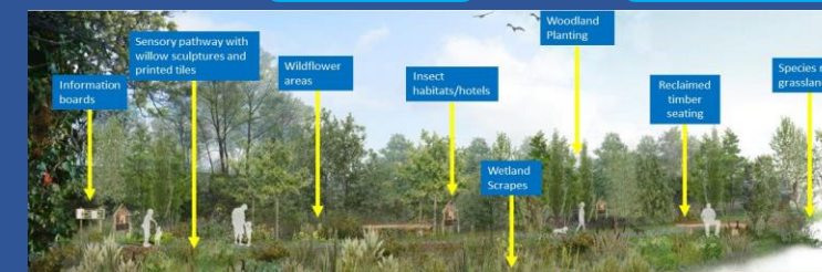
Beezon Fields Community Nature Area