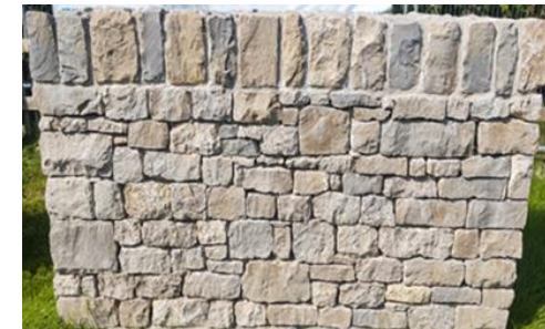
Natural Stone Cladding

The flood wall is expected to be complete in Summer 2023.