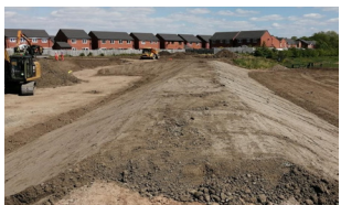
RADCLIFFE AND REDVALES