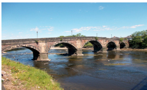
PRESTON AND SOUTH RIBBLE