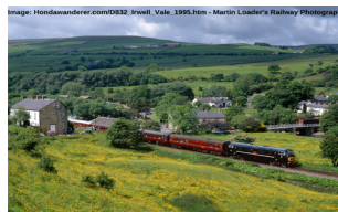
IRWELL VALE, STRONGSTRY AND CHATTERTON