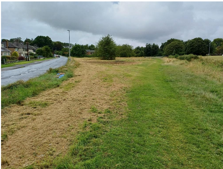
Image: View of cleared work area, looking from South to North

The embankment will be constructed from South to North, with CHC making sure to remove only the relevant sections of the existing temporary sandbag and visqueen barrier as construction progresses. This approach will maintain the required level of flood protection for the community throughout duration the works.