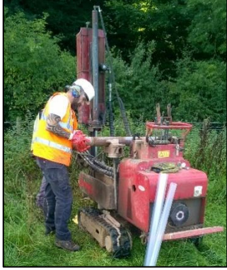
Window sample rig