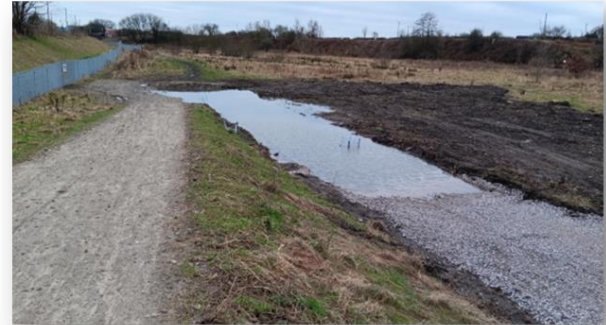
Access Track Progress at Lower Hinds