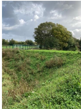
Grass growth on embankment at Buckley Wells