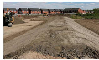
RADCLIFFE AND REDVALES