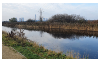
PENKETH AND WHITTLE