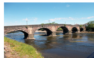
PRESTON AND SOUTH RIBBLE