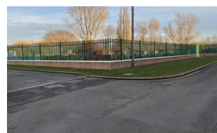
CARLISLE PHASE 1B