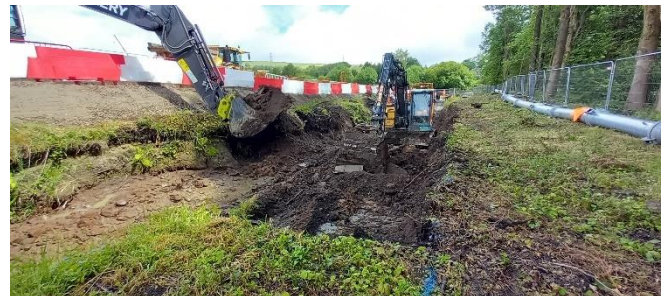
Excavation in Greenvale brook channel to create the spillway

Piling has commenced alongside the railway line. These piles form the retaining walls that retain the flood flows from Greenvale Brook and River Roch within the reservoir during its operation.