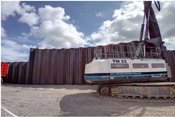
Piling alongside railway line

At Gale East , the Contractor has commenced works on the access track for access to the Gale East Diversion Structure.