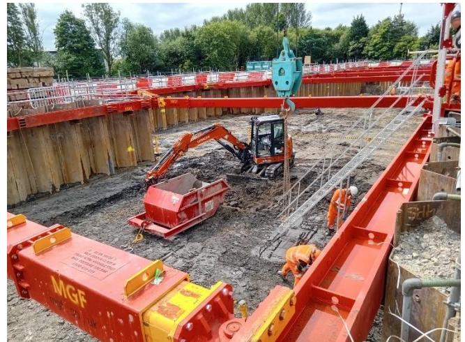
Excavation within the cofferdam for the outlet structure

At Gale West , the first phase of the sheet piling works are now completed. The sheet piles create a cofferdam for a safe and dry working area prior to starting construction of the outlet structure for the flood storage reservoir. Excavation within the cofferdam is underway down to the formation level where the outlet structure will be installed. Noise and vibration monitoring continues whilst the construction is underway.