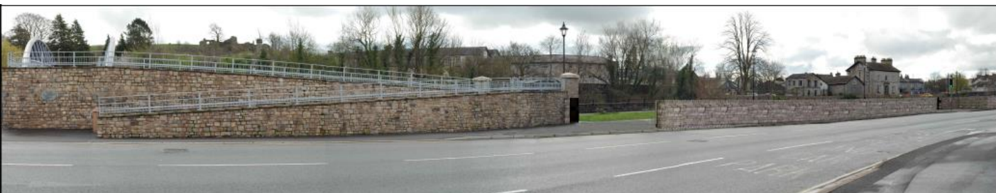
Visualisation showing proposed flood wall and access point to New Road Common