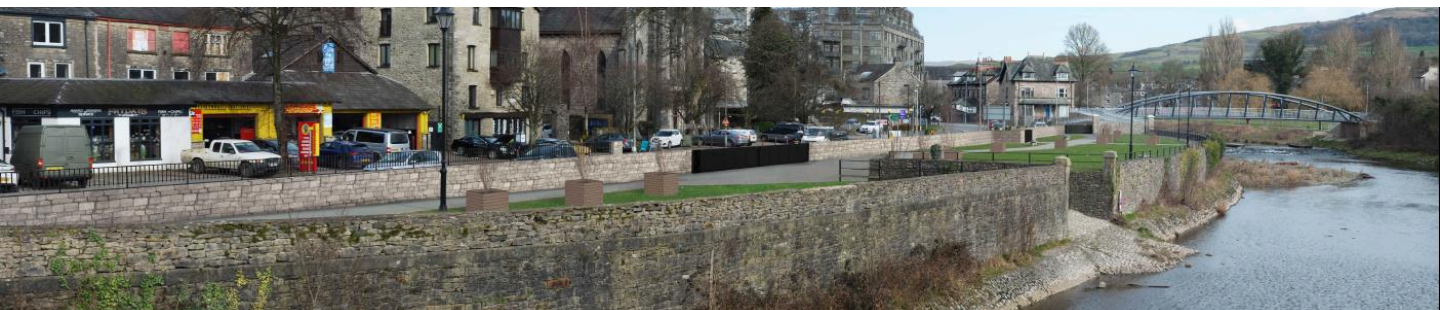
Visualisation showing proposed flood wall and integrated flood gates maintaining a safe open space for the community and visitors of the town

The new flood defences will extend from Gooseholme Bridge to Miller Bridge along the roadside of New Road. The flood wall will be finished in natural stone and have integrated flood gates to retain access for all into the Common.