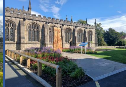
Flood wall and amphitheatre feature

A new ramped access has been created from Kirkland onto the riverside enabling access for all. A hand carved timber sculpture has been commissioned and placed in the grounds of the parish church celebrating the importance of the River Kent in Kendal's past.