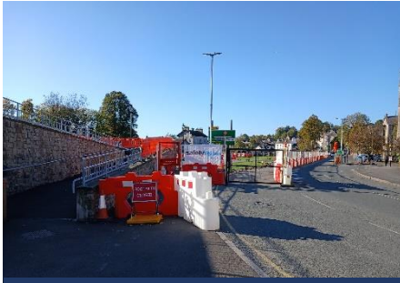
Pedestrian crossing location

We operate 24hour on site security which keeps our site safe during the daytime and overnight. The site has taken the Common and the filter lane on New Road and is required to be this size to ensure all of our construction works, materials and machinery can operate safely in the contained space.