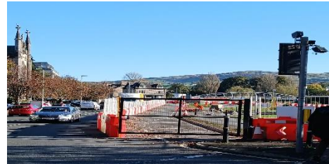
Pedestrian crossing remains open at Miller Bridge

Photos show site setup arrangements and working area. A temporary pedestrian crossing is in place adjacent to Gooseholme Bridge. Please ensure the crossing is used in order to keep everyone safe.