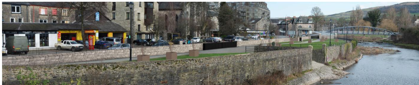
Visualisation showing alignment and extent of the new flood wall

Piling is an effective method and has been used in other areas of the scheme. There can be some noise and vibration impacts from piling activities. As part of our mitigation measures, noise and vibration monitoring will be in place during these works. If either noise, or vibration exceeds our agreed limits, the activity will cease until it can be delivered within the limit.