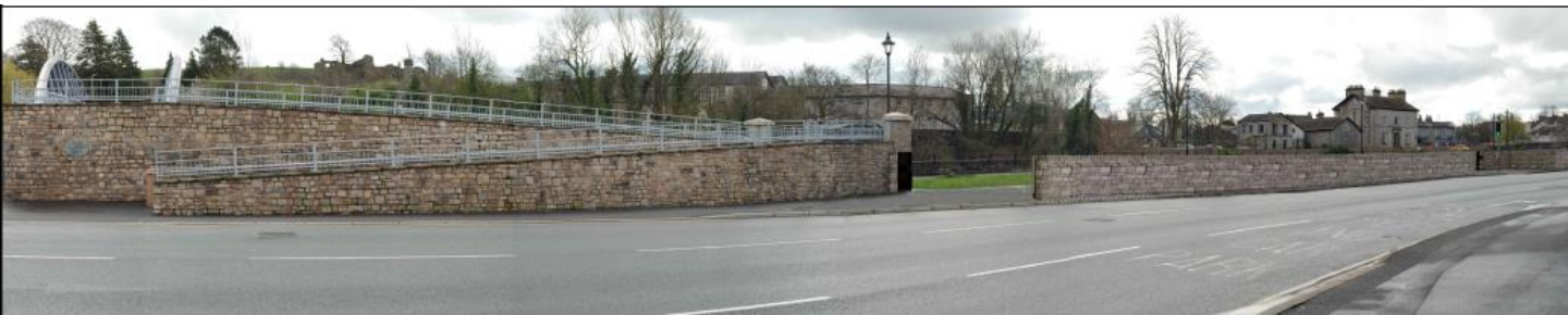
Visualisation showing proposed flood wall and access point to New Road Common

Our winter working hours are Monday to Friday 08:00 to 18:00. If we should need to undertake any works at a weekend, our hours will be 08:00 to 18:00 on Saturday only. If Saturday working is required, we will communicate this to you.