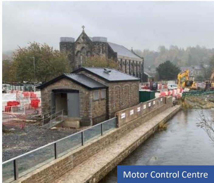
Motor Control Centre