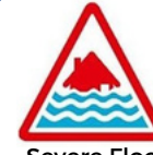
Severe Flood Warning