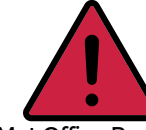
Met Office Red Weather Warning