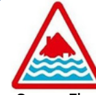
Severe Flood Warning