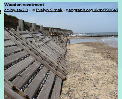
Wooden revetment

Revetments are sloping structures built on embankments or shorelines, along the base of cliffs, or in front of sea walls to absorb and dissipate the energy of waves in order to reduce coastal erosion. They can be made of concrete, stone, asphalt or wood, and the height of the revetments is designed to stop waves overtopping the defence. Revetments can be both permeable and impermeable; the permeable revetments are generally built from rock or concrete armour, gabions, and timber. They reduce the erosive power of waves by dissipating their energy as they reach the shore. Impermeable revetments are continuous sloping defences made of stone or concrete which act as a fixed line of defence and are designed to act as a barrier against high tides and storm surges.