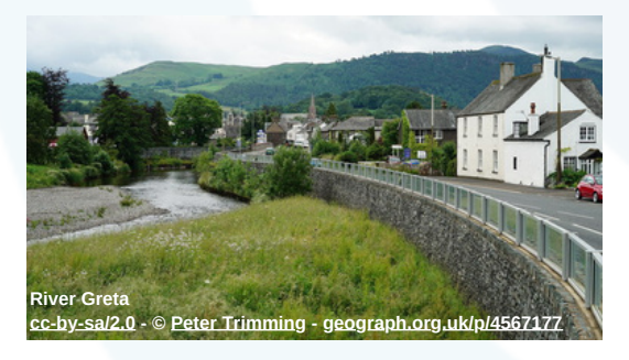
Flood Defence Wall