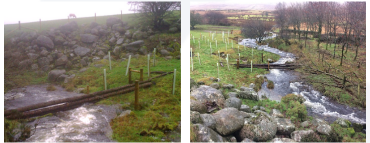
Images of leaky dams.