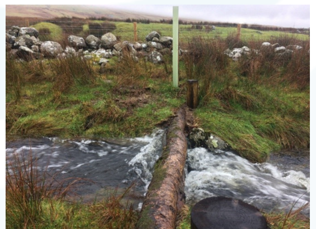
Image of leaky dam