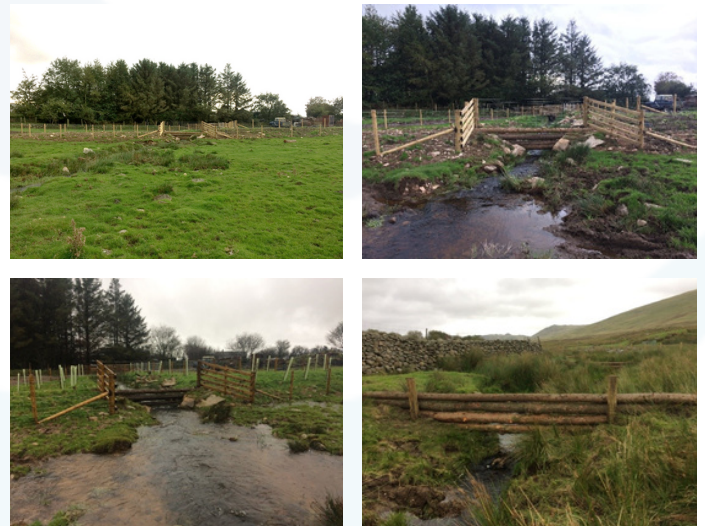
Images of project area and leaky dams.