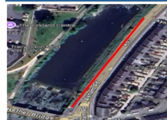
Area of Gas works by Cadent Gas