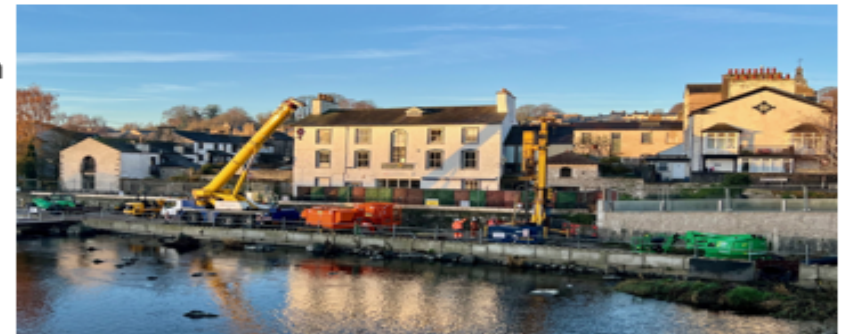
View of Waterside and the trail piling being completed