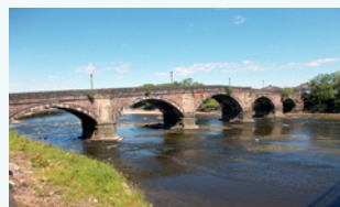
PRESTON AND SOUTH RIBBLE