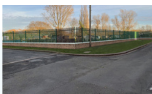
CARLISLE PHASE 1B