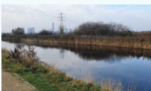
PENKETH AND WHITTLE